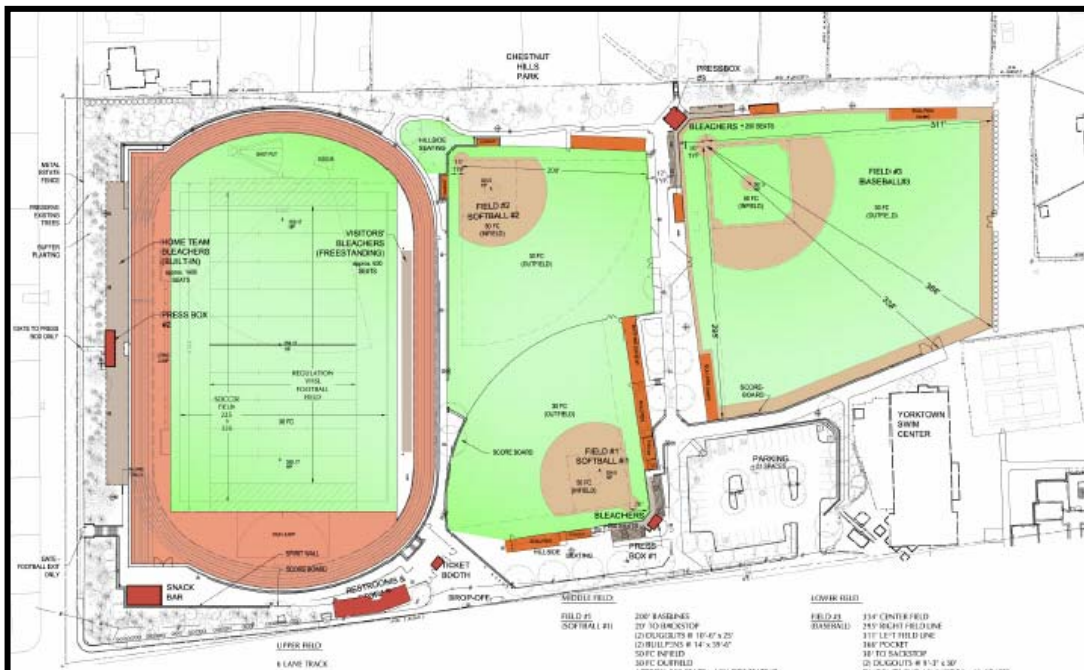
Greenbrier Park Final Renovation Plan